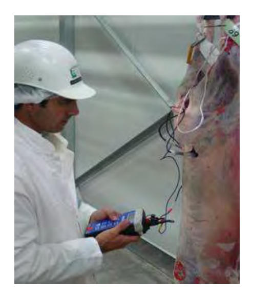
Figure 2. Standard pH measurement location.

Standard pH measurement location is found at the lumbar-sacral junction, overlaying fat is cut away so as to prevent fouling of the pH electrode (Figure 2).